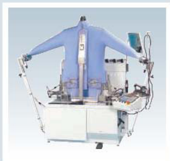
F4VA1 shirt finisher

The machines are easy to use, even for unskilled operators, ensuring high output and consistency. In fact, one operator can process up to 40 shirts every hour*.