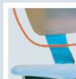
F34B1 Utility Laundry Press