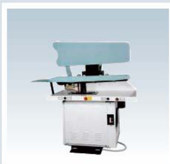
F3AA3 leg shape press