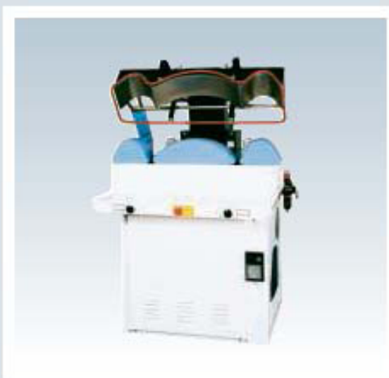
F3AB2 collar and cuff press