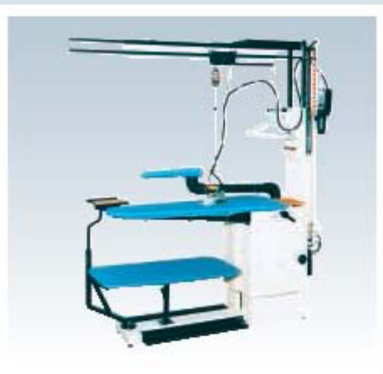
F3TK1 finishing table

The professional F3TK1 finishing table has many features such as a powerful vacuum and hot air blowing that help even unskilled operators achieve high output and quality finishing results. For your cleaning operation, this means higher productivity and improved economy.