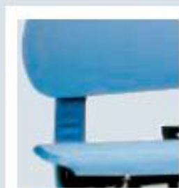
F34A1 Utility Dry Work Press

Electrolux Professional's finishing equipment includes a selection of heavy-duty presses. The models are arranged for dry work (padded head) or laundered work (polished head). What's more, our heavy-duty presses come in a wide variety of shapes for most pressing applications.