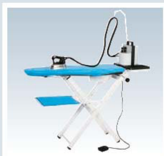
F4TD ironing table

The portable F4TD ironing table is an example of a simple, low-cost alternative to the traditional ironing table. It is ideal for laundries with low output demands and limited floor space. Because this ironing table is electrically heated, installation is simple. All you need is a domestic electrical supply. Every F4TD ironing table comes with a durable, self-feed steam iron. The F4TD ironing table is equipped with a small boiler that gives you 2 hours of continuous ironing. The table allows you to do easy touch-up. It can be installed in your drop off store or by the counter for excellent quick and easy touch-up.