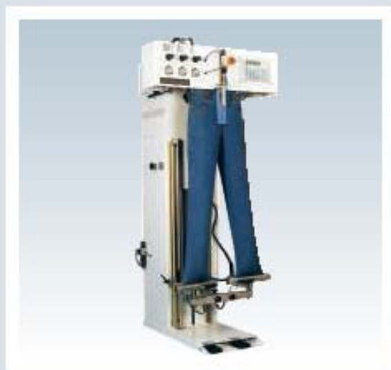
F4CD trouser conditioner

Safe, user-friendly systems for high output Electrolux Professional's systems for finishing trousers are designed for maximum operator safety. The equipment is also easy to use, which allows the operator to process a large number of finished garments.