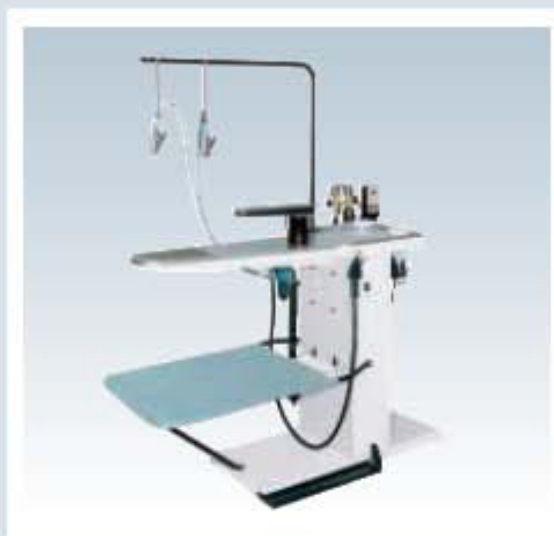
F3SA spotting table

This is the end of stains for you and your customers!